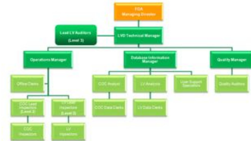
Figure 2: Organisational Structure of the LVD

The LVD Divisions and their respective roles are as follows: