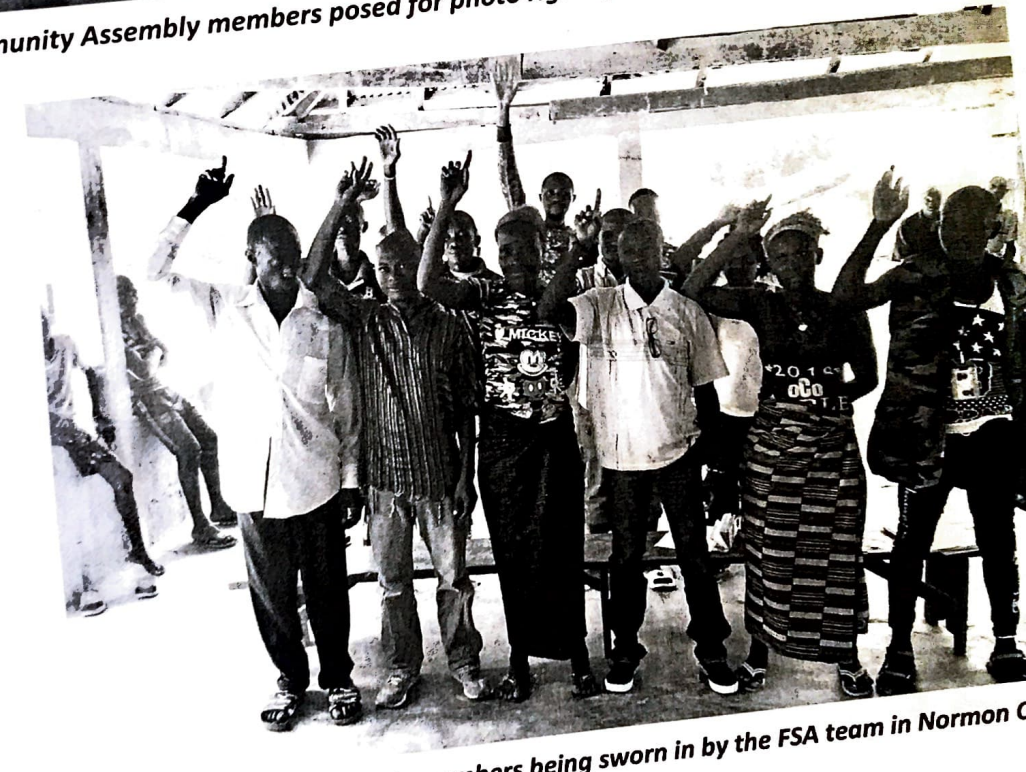
Community Assembly members being sworn in by the FSA team in Normon C